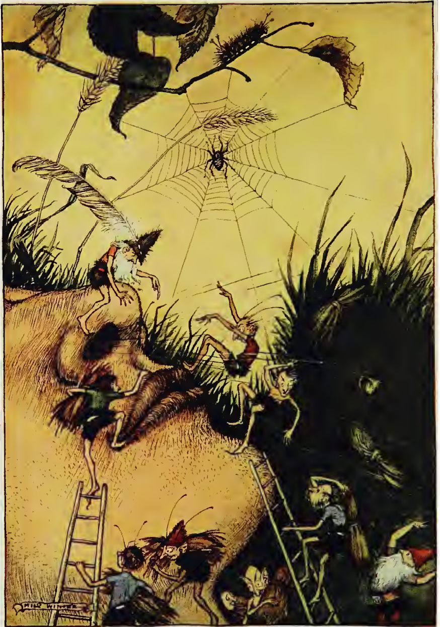
The enemy's breath rushed out of his nose in an obstreperous hurricane and whirlwind